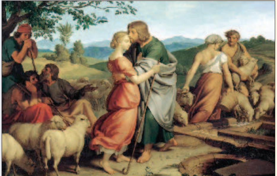
▲ Jacob Encountering Rachel with her Father's Herds by Joseph von Führich, 1836, oil on canvas, 66 x 92cm.

I was among the first in Israel to purchase the eagerly awaited coin, which was housed in a specially designed olive-wood case. Unfortunately, I was not to bask in the rosy glow of acquiring the little gold coin for long. Immediately after the new sheqel's release, rumors of a serious design flaw started to circulate among coin dealers as well as local club and national numismatic association members. Initially, it was thought that a batch of coins had a die error on the reverse in the Arabic word